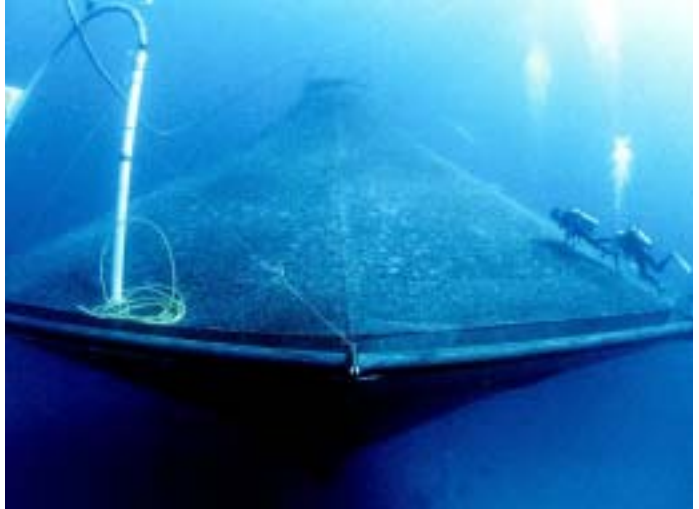
The SeaStation 3000 is an experimental aquaculture facility off the coast of Hawaii. The sea cage lies 40 feet below the surface to reduce the risk of harm to the cage or the fish from large ocean swells and is out of the way of local boating traffic. The project is the first of its kind in Hawaii and may serve as a model for future offshore aquaculture.

Enhanced investments in research, demonstration projects, and technical assistance can further the development of a responsible and sustainable marine aquaculture industry. Science-based information can help the industry address environmental issues, understand socioeconomic impacts to coastal communities, conduct risk assessments, develop technology, select species, and improve best management practices. It is also vital for developing fair and reasonable policies, regulations, and management measures.