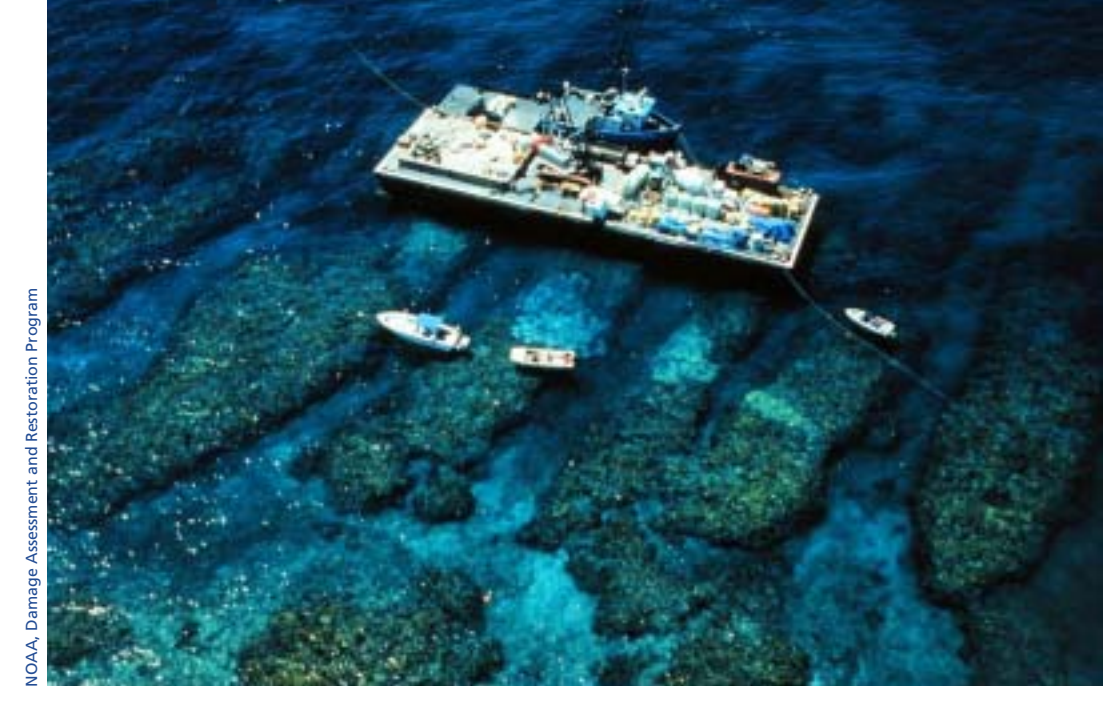
Accidental vessel groundings can cause devastating damage to fragile coral reefs. Restoration efforts, such as the project illustrated here, can help promote recovery. Boulders are placed on the damaged reef to create a substrate for transplanted corals and future natural growth.