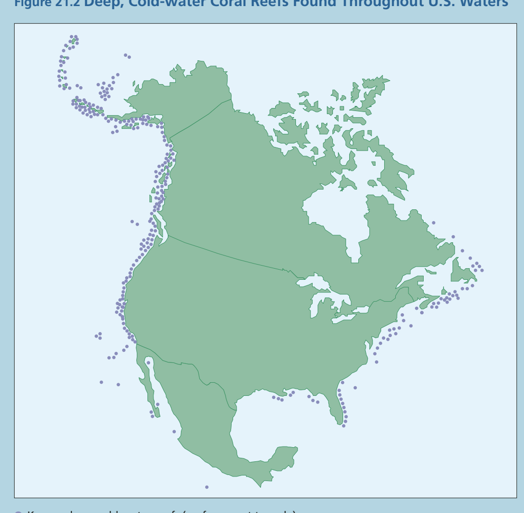
Figure 21.2 Deep, Cold-water Coral Reefs Found Throughout U.S. Waters

Coral reefs are declining at a disturbing pace.8 The causes of this decline are varied, particularly for warm-water reefs. Many scientists believe that excessive fishing pressure has been the primary threat to coral ecosystems for decades. However, pollution and runoff from coastal areas also deprive reefs of life-sustaining light and oxygen, and elevated sea surface temperatures are causing increasingly frequent episodes of coral bleaching and