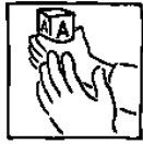
Goal 1: Ready to Learn