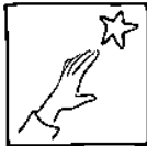
Goal 3: Student Achievement and Citizenship