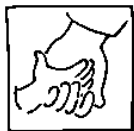
Goal 8: Parental Participation

Mandatory drug testing controversies have ignited in schools nationwide, but Dutch Fork's call for voluntary testing is an attempt to circumvent privacy issues.