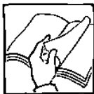
Goal 6: Adult Literacy and Lifelong Learning