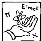
Goal 5: Mathematics and Science