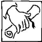
Goal 2: School Completion