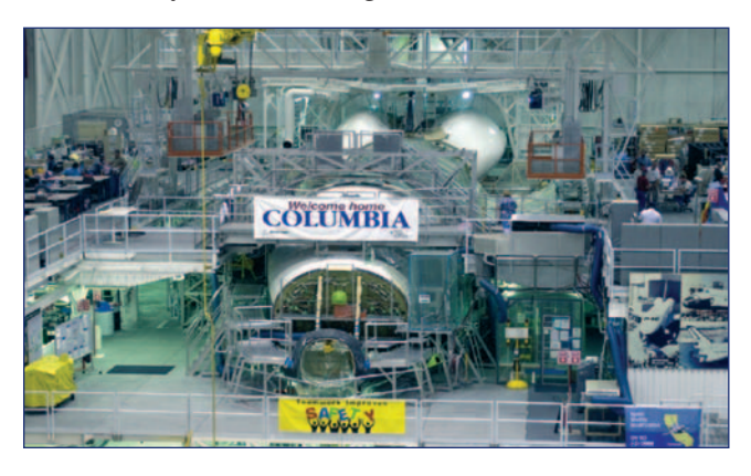
Figure 3. OV-102 undergoing OMM at Boeing's Palmdale facility.

A comparison of the infrastructure at both locations shows them to roughly be on par. KSC has three processing bays, whereas Palmdale has two. KSC became "maxed out" after the move, with four Orbiters and only three bays. One illustration of the impact of this Orbiter overpopulation is OV-103's movement at least 6 times in 9-months while awaiting an OMM location decision. These moves unnecessarily consume manpower, take time, can be disruptive if maintenance is in progress, and creates opportunities for mistakes; when OMMs were performed at Palmdale, this was typically not an issue. The loss of Columbia alleviated this situation since there are only three remaining Orbiters.